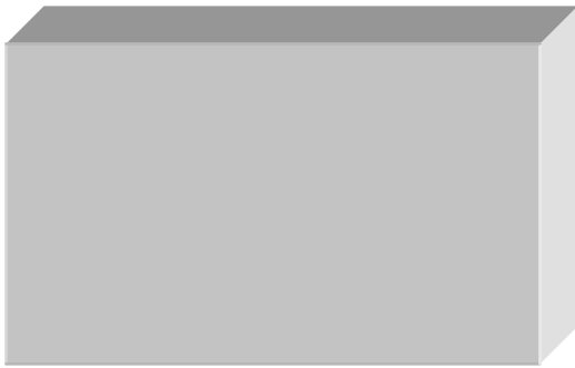
Finished Accreted Cell

Plates are placed 0'-1/2" apart to desired thickness